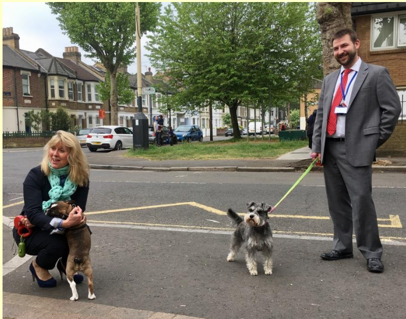
Alternative careers in doggy daycare beconing?